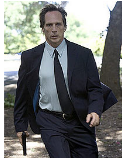
Mahone in Season 2.

Because he is unable to capture Michael, Mahone orders Agent Lang (Barbara Eve Harris) to follow Michael's girlfriend Sara Tancredi (Sarah Wayne Callies) . [15] Mahone's sanity begins to unravel from his determination to catch Michael and Lincoln, and from his benzodiazepine addiction. Michael and Lincoln travel to Panama, where Mahone lures them into a trap by impersonating fellow escapee Fernando Sucre (Amaury Nolasco) . He captures Lincoln and contacts Michael, ordering him to surrender Charles Westmorelands (Muse Watson) five million dollars and his boat, the Christina Rose . [16] Michael plants drugs on the Christina Rose ,